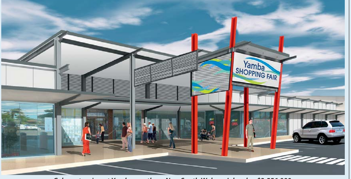
Coles extension at Yamba, northern New South Wales - Job value $3,556,000.