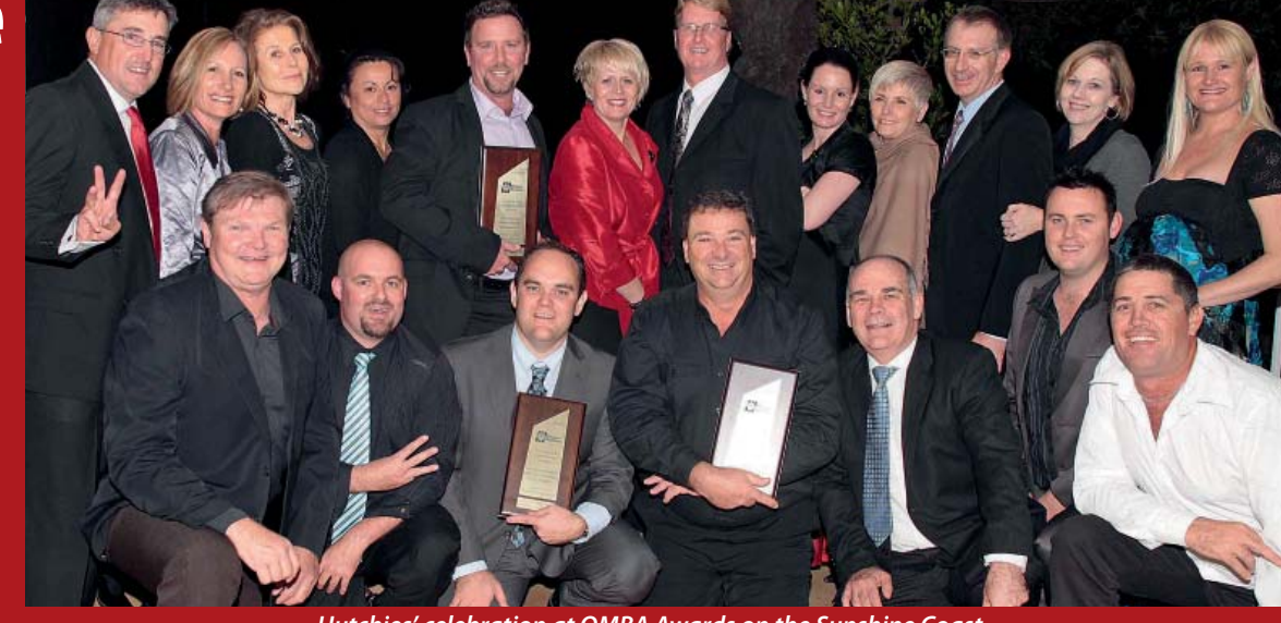
Hutchies' celebration at QMBA Awards on the Sunshine Coast.

HUTCHIES scored three prizes at the recent QMBA Awards night on the Sunshine Coast. Hutchies' team received recognition for Commercial Buildings (Office Accommodation) up to $4 million - 'Marquesas' Peregian Beach; Innovation in Workplace Health and Safety; and Innovation in Environmental Management Government Office Building, Maroochydore.