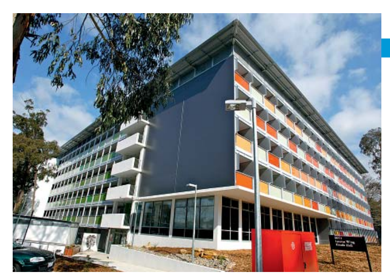
View of the completed Laurus Wing of Ursula Hall at the ANU.